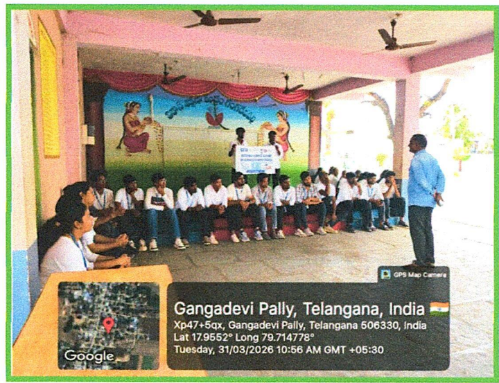
Caption: Save water, secure the future.